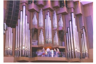
OSQ members get their hands on the QPAC Klais organ console in February 2023.

The OSQ conducts organ tutorials for organists in local churches, tailoring sessions to the interests and needs of the participants. An organ consultancy service is also offered to assist local churches in matters relating to organ repairs, rebuilds, and new instruments (digital as well as pipe organs).